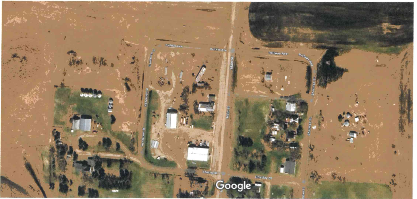
Image © 2025 Airbus, CNES / Airbus, Maxar Technologies, Données cartographiques © 2025 20 m